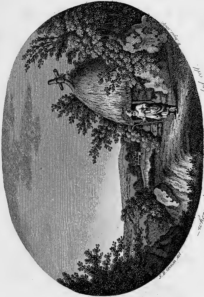
- where the Hermit hangs his straw-dad cell.